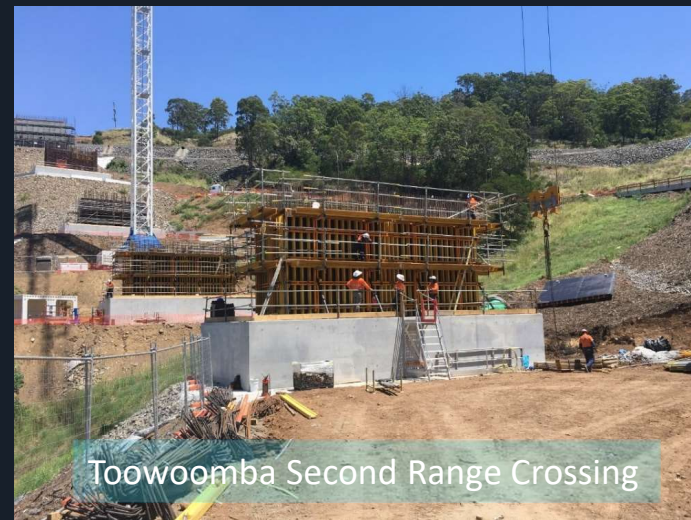
Toowoomba Second Range Crossing

A FEW OF THE PROJECTS WE ARE PROUD TO HAVE ADDED GREAT VALUE