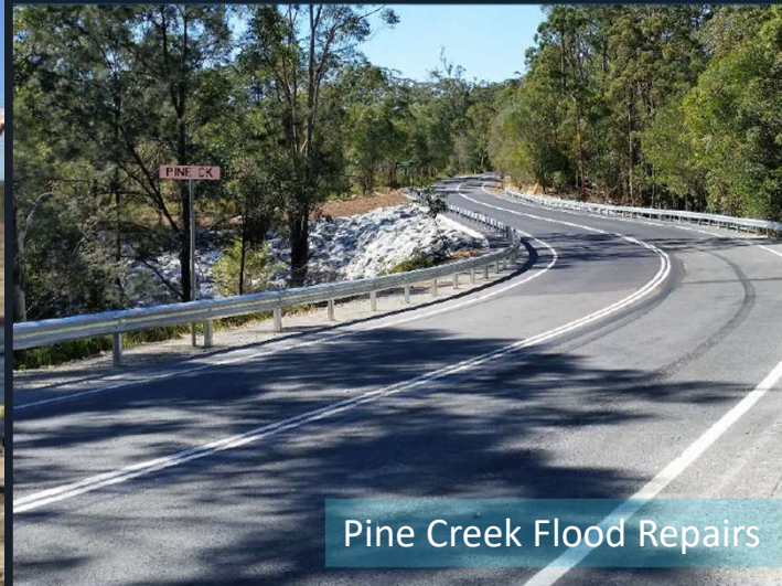
Pine Creek Flood Repairs