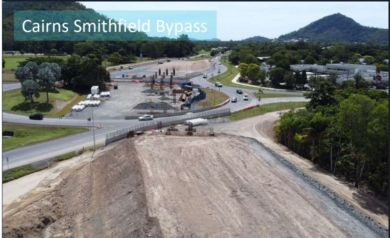
Cairns Smithfield Bypass