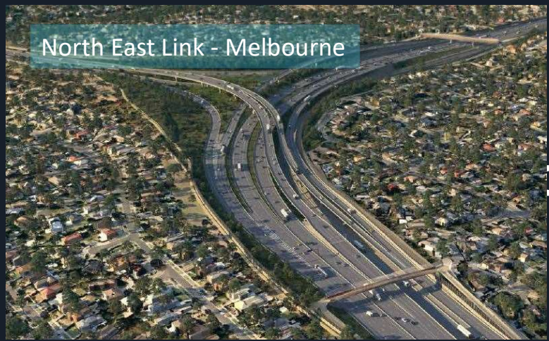
North East Link - Melbourne