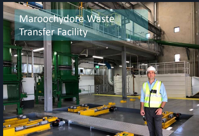
Maroochydore Waste Transfer Facility