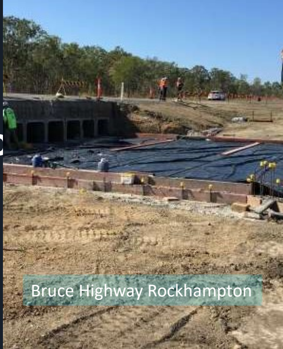
Bruce Highway Rockhampton