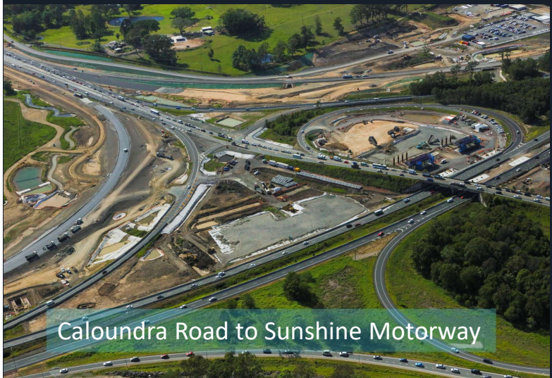
Caloundra Road to Sunshine Motorway